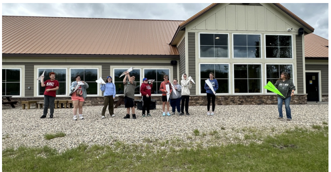
NDVS/SB students flying paper airplanes outside of Annie's House near Bottineau, ND, last June.

For more information, visit <u>https://annecarlsen.org/recreation/anni</u>es/.