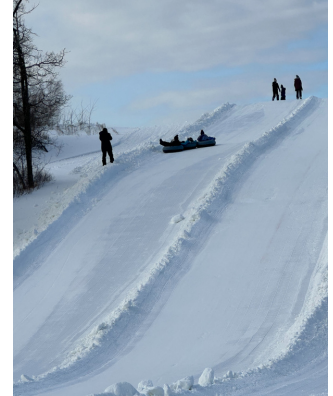
Above left, NDVS/SB students tubing during Winter JAM, last December. Annie's House can be seen in the background. Above right, students tubing down the big hill near Annie's House in 2023.